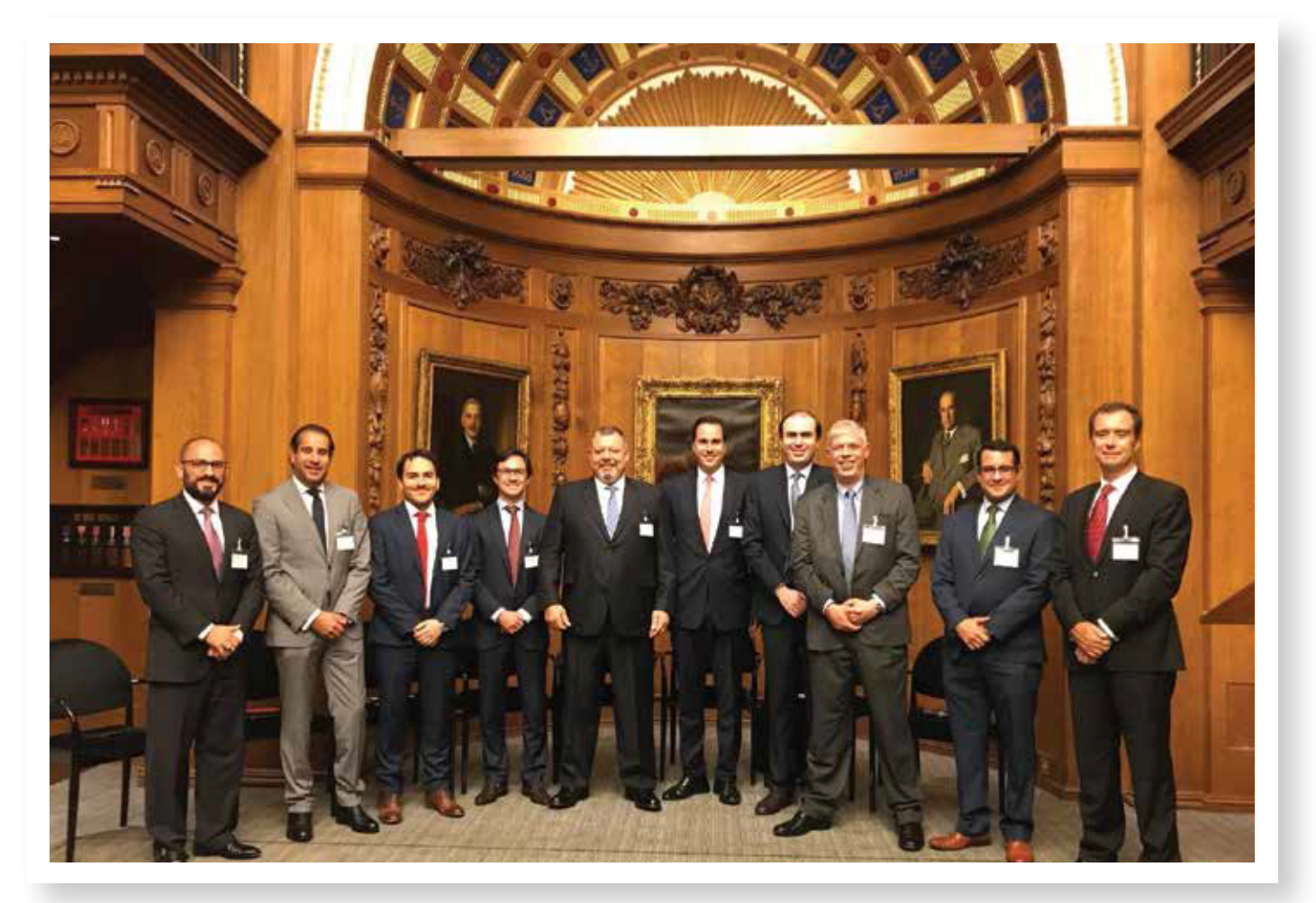
Insuralex team in Latin America